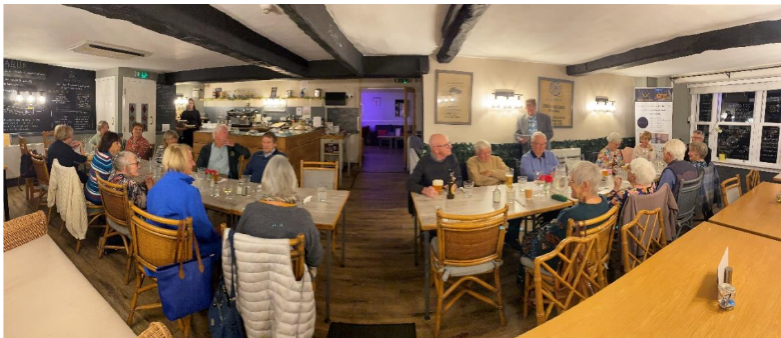
NOSCA October laying up dinner at the Roade House, Roade Northamptonshire.

Please contact Neil if you are interested